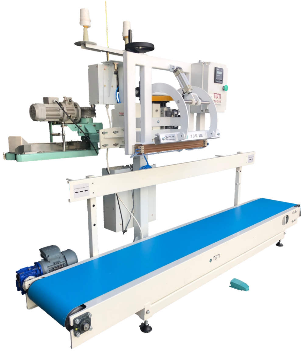
DOUBLE HEAD SEWING & SEALER MACHINE