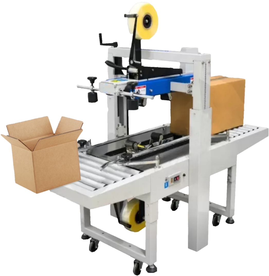
BOX SEALER MACHINE